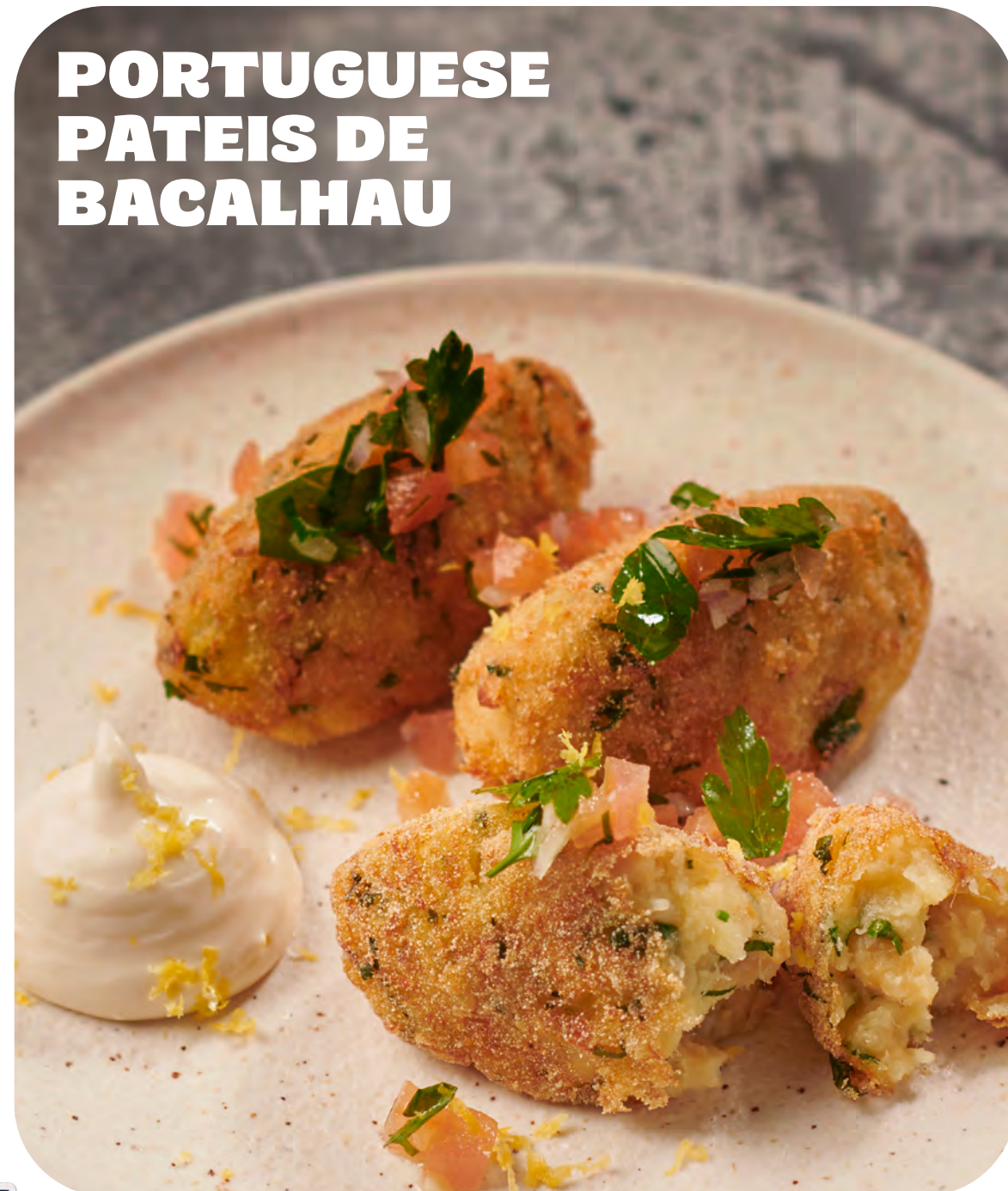
PORTUGUESE PATEIS DE BACALHAU