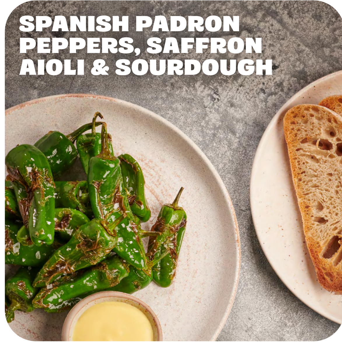
SPANISH PADRON PEPPERS, SAFFRON AIOLI & SOURDOUGH