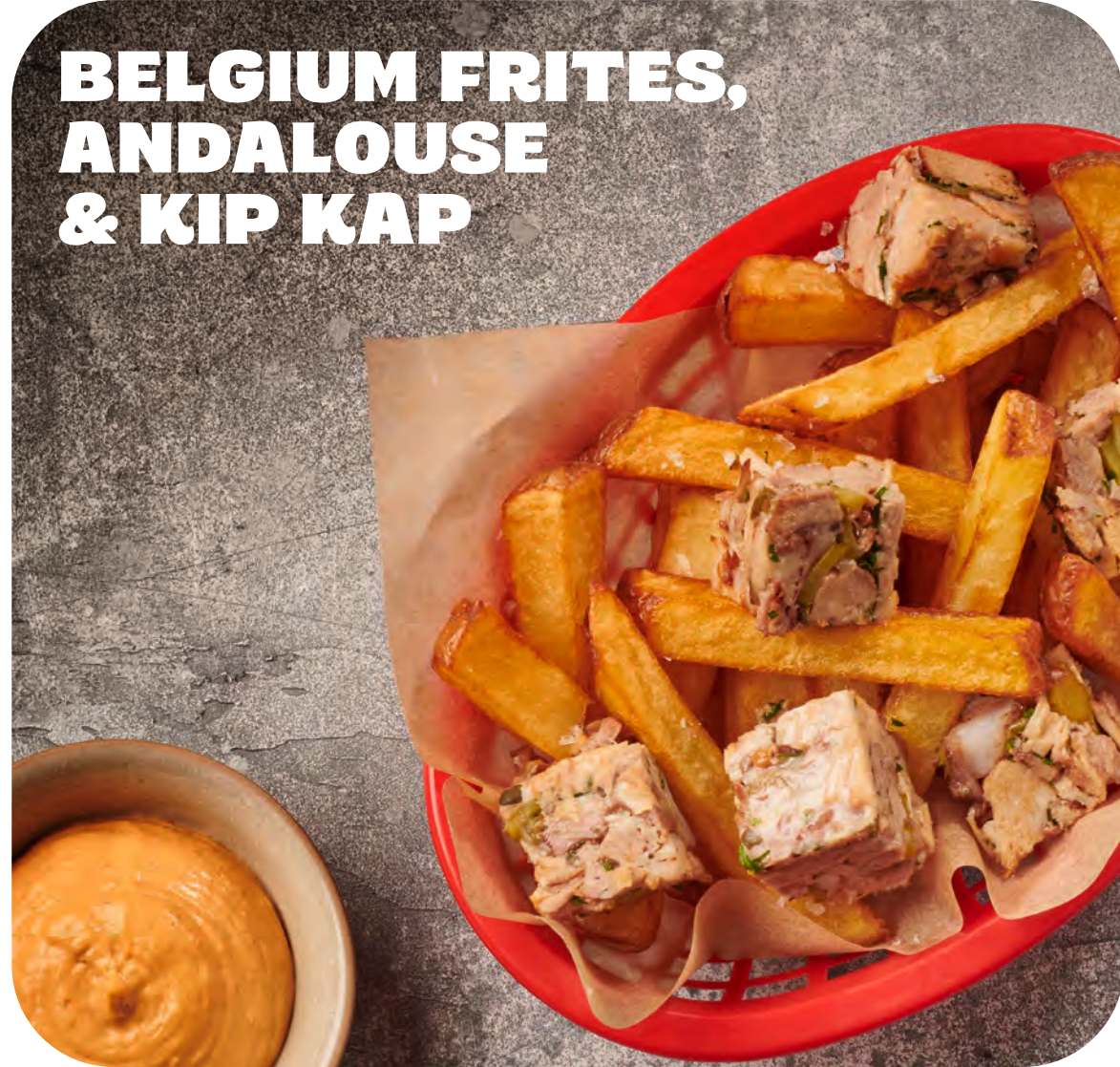
BELGIUM FRITES, ANDALOUSE & KIP KAP