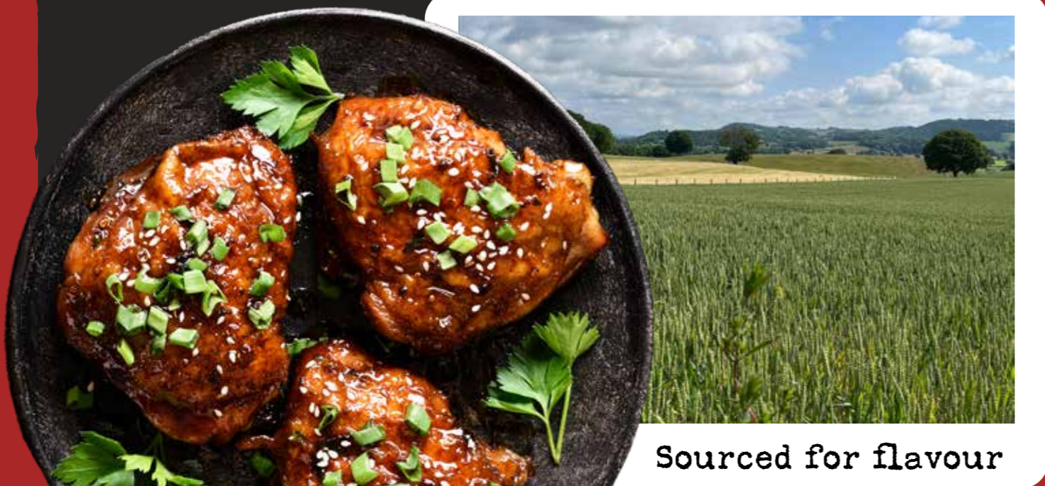
Sourced for flavour