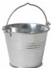
Galvanised Mini Bucket (7x6cm) 12.5cl