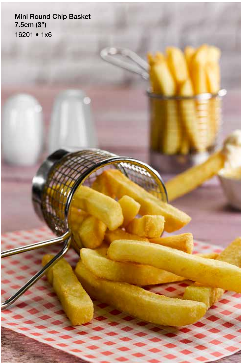
Mini Round Chip Basket 7.5cm (3") 16201 • 1x6