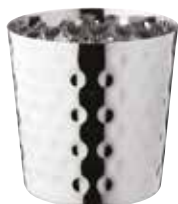
Chip Cup Hammered Finish 3-3/8x3-3/8"

Give your chips a chance to show off on the plate by choosing the best container to serve them